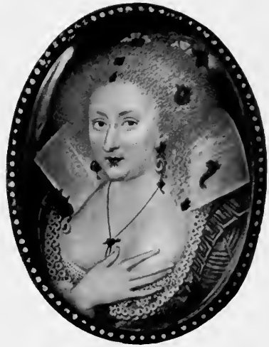
QUEEN ANNE OF DENMARK BY ISAAC OLIVER